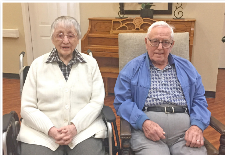
Let's Get Together Social