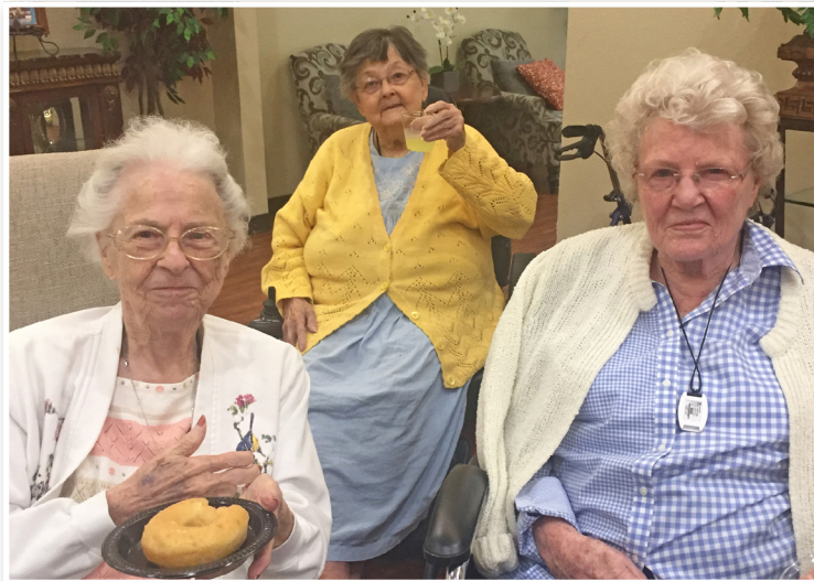
Donut and Lemonade Social