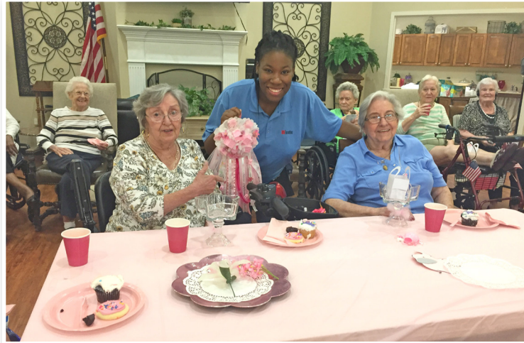
Baby Shower Social

Come and join us at our Assisted Living to celebrate different and fun socials!