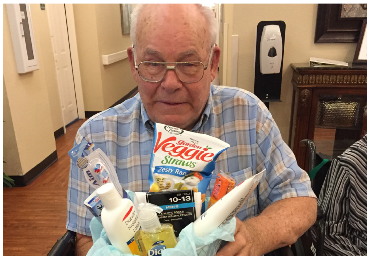
Fun Time and Prizes Social Hour