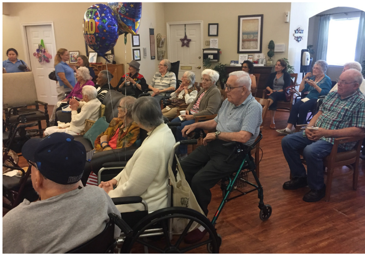
Father's Day Social Hour

Come and join us every Friday at 2 p.m. for a fun social hour. We have fun themes, entertainment and awesome prizes.