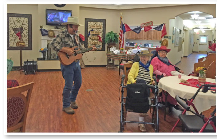
Rodeo Roundup Party